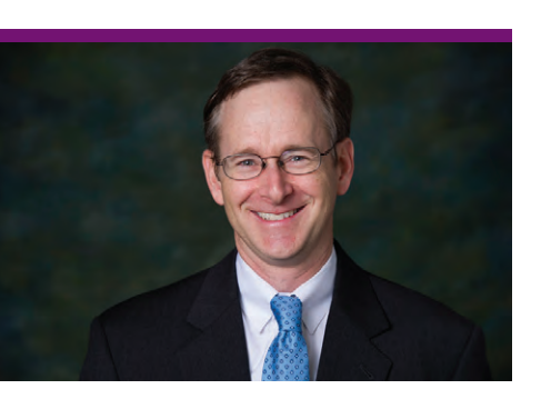
Letter from the Director